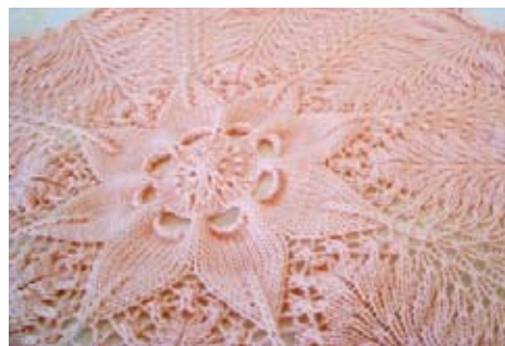
Beautiful Hemlock Ring Throw

Our beginning classes are as popular as ever we even had a few weeks this summer where we had a waiting list — yes, Francine is that good a teacher. Send a friend in the month of September when we offer an introduction to knitting and crochet. This class is free with a kit purchase. The kit includes