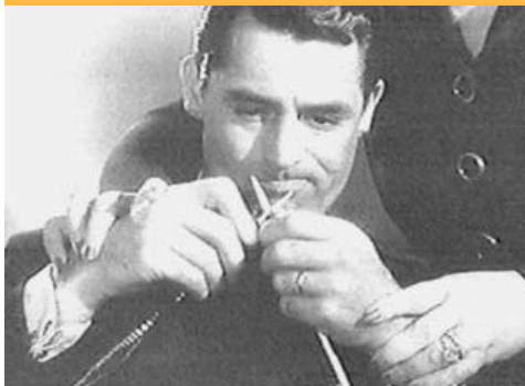
Cary Grant, during the filming of Mr. Lucky.

October 7, 14, 21, 28 November 4, 11, 1, 27 December 2, 9, 16, 23, 30